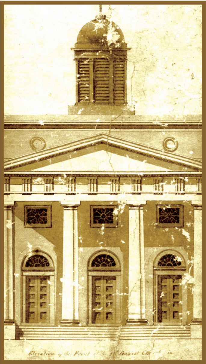
THE FIRST BAPTIST CHURCH charleston, south carolina